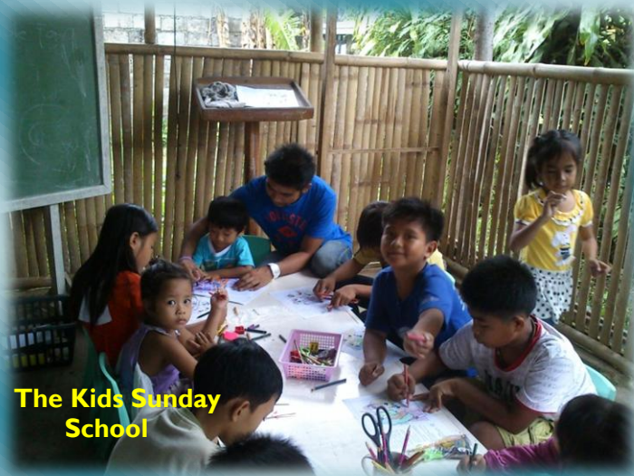
The Kids Sunday School

Thank you for involving yourself in this mission!!