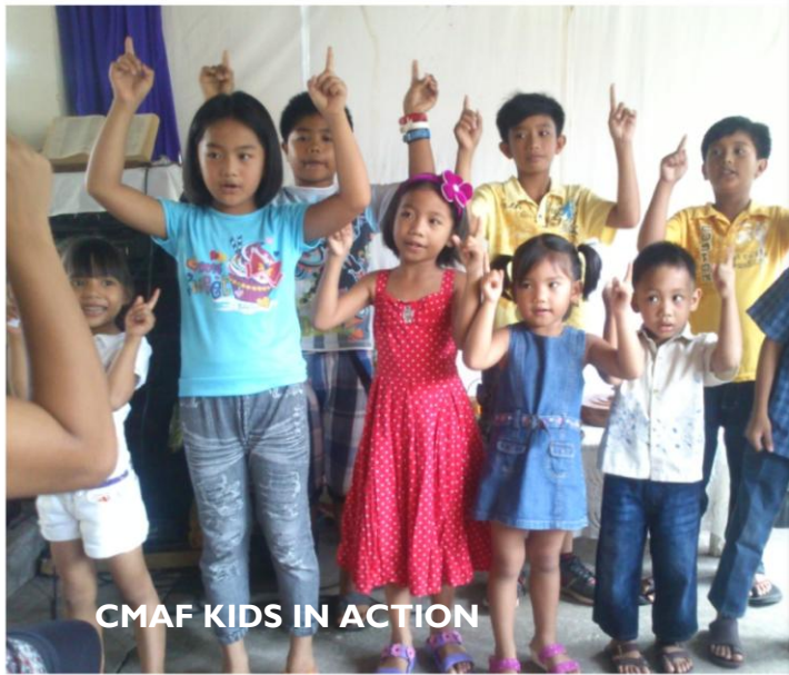
CMAF KIDS IN ACTION

Here are a few pictures from CMAF and at LCI village living.