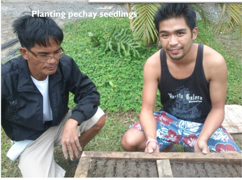
Planting pechay seedlings