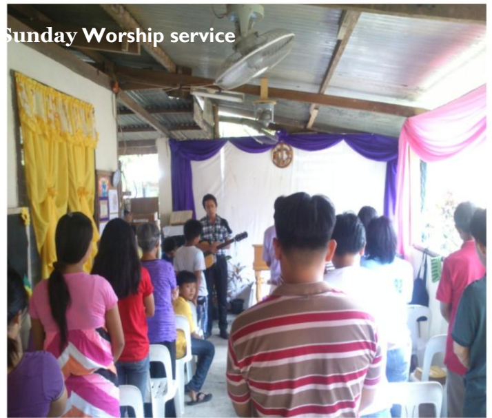
Sunday Worship service