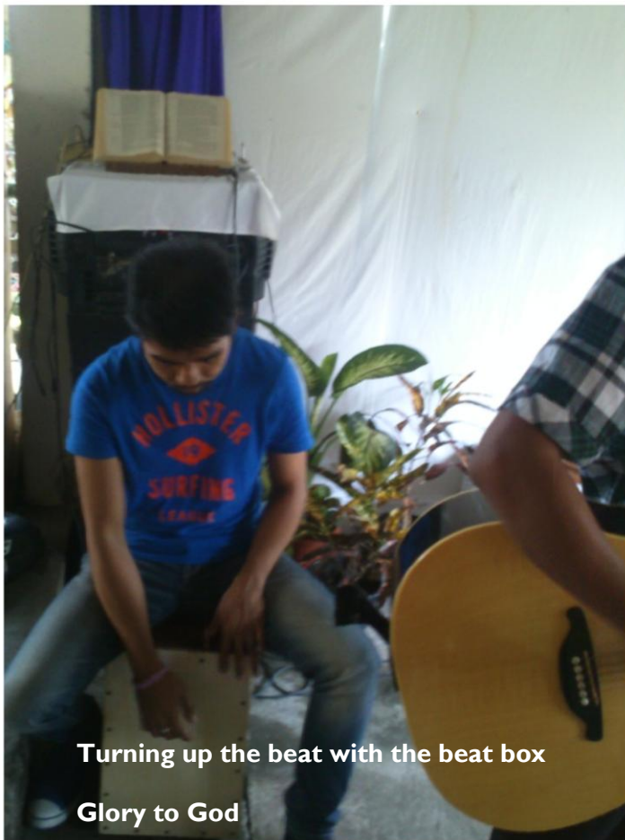
Turning up the beat with the beat box Glory to God