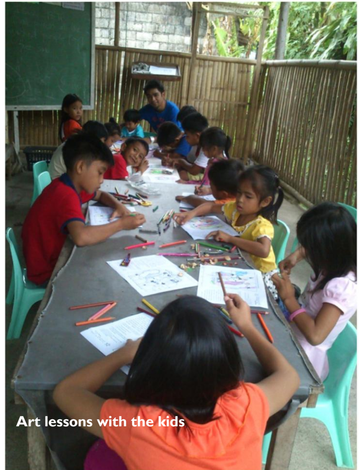
Art lessons with the kids