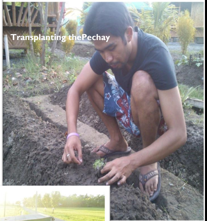
Transplanting the Pechay