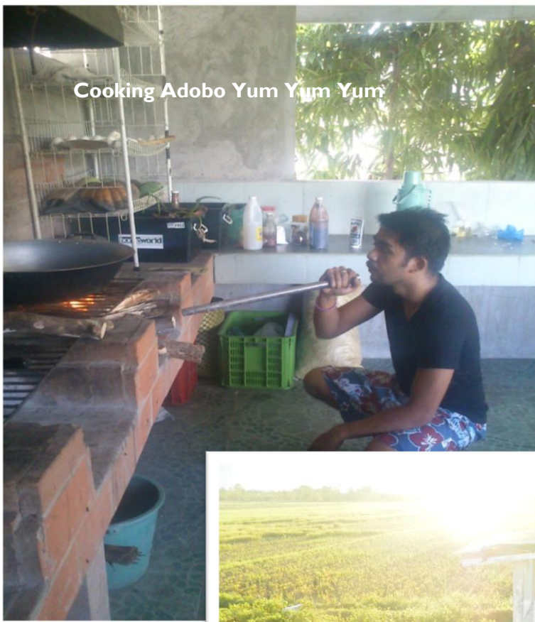
Cooking Adobo Yum Yum Yum